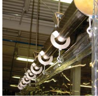
NEW Clean-Screen USDA Grade Curtains