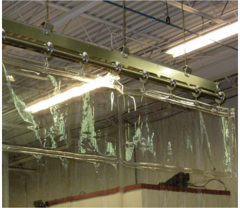
TMI's new Clean-Screen and Easy Glide track system allow for safe, effective, and efficient wash down of sensitive machinery and equipment.

Food Processing, Wash Down Areas, Clean Rooms, Car Washes, and more