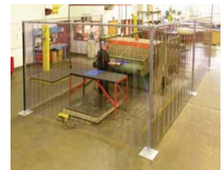
Strip Door Enclosures