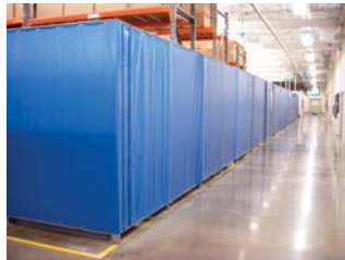
Free Standing Curtains