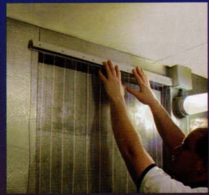
SNAP THE CAP SHUT