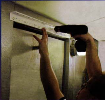
ATTACH MOUNTING BAR