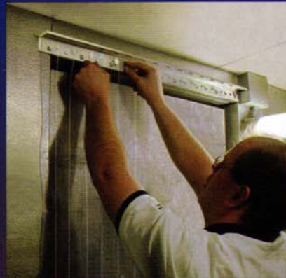
HANG PVC STRIPS