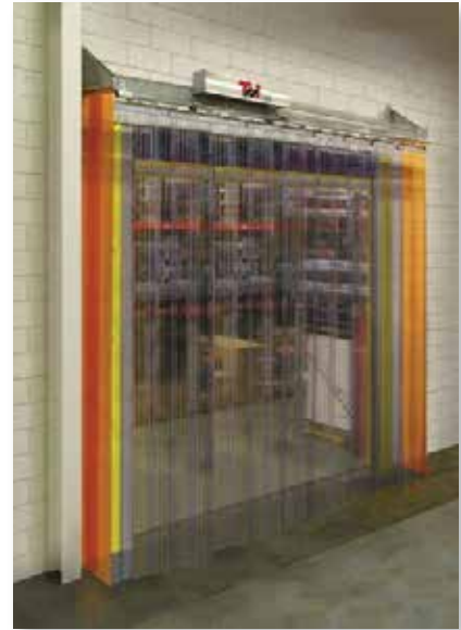
One-Sided Single Motor System: Up to 14' 0" Wide