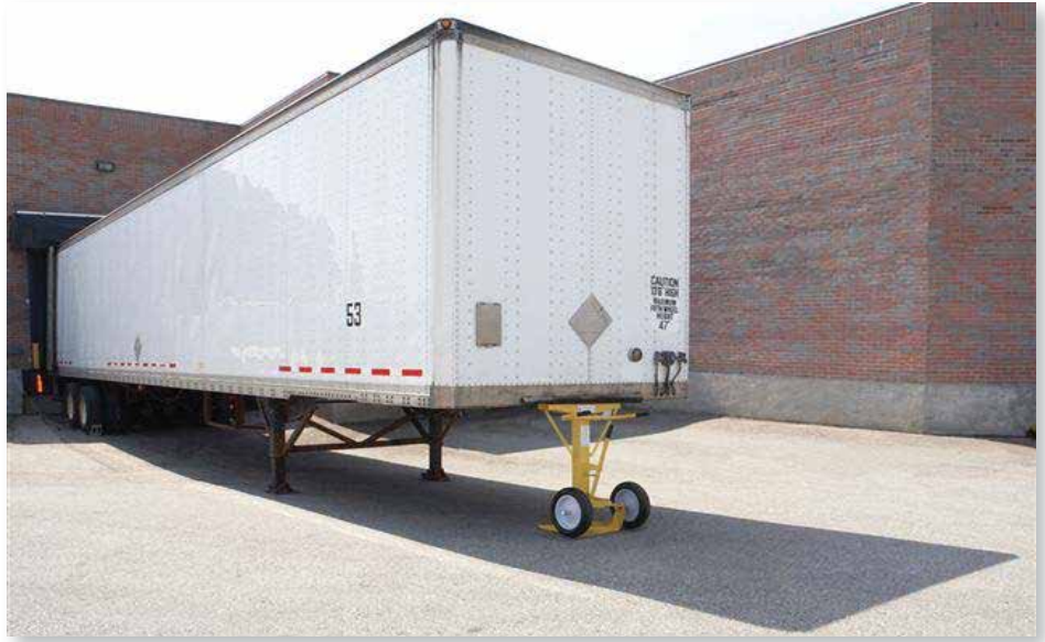
The easiest, most convenient, and safest trailer stand available

TMI is a trusted name in managing dock and door safety, especially when it comes to preventing landing gear collapse, which has the potential to cause serious injuries and damage to people and equipment. TMI's Trailer Stands are the best solution to increase workplace safety.